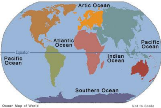
Oceans Affect Weather